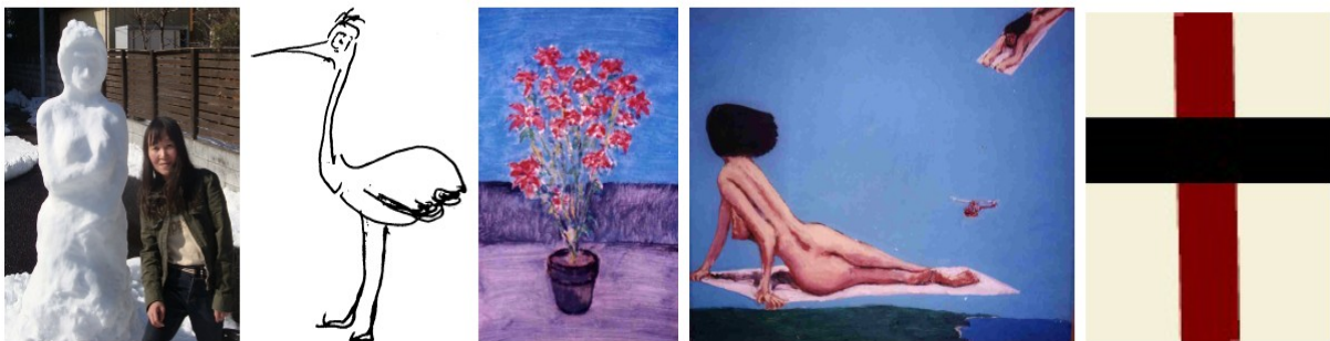
Fig. 3. Arts: Five examples of works by various artists [35]

There are many sciences about art. Aiming the specific application of the classification, the topics of customs and arts are presented here only declaratively.