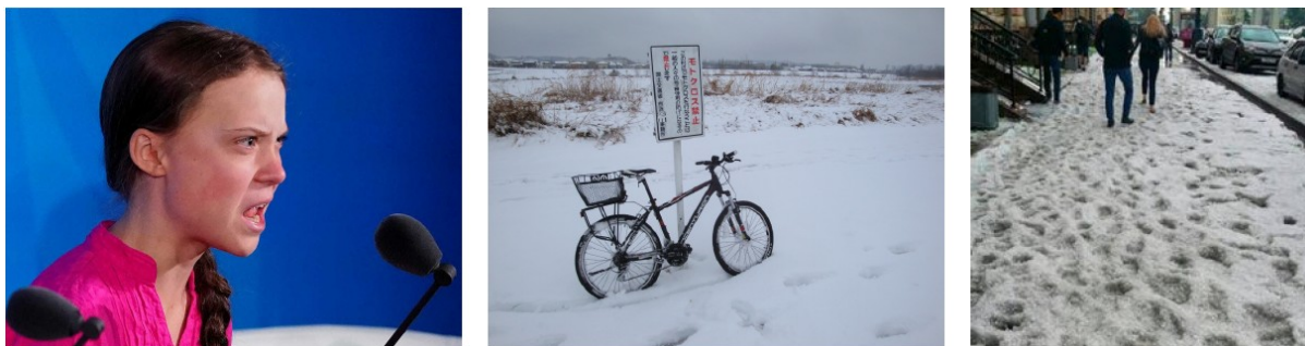
Fig. 7. Greta Thunberg, 2019 [76] ; Japan, Tama 2013.01.14 [77] ; Peterburg 2017.07.22 [78]

Another example refers to the Global warming. Since year 2019, this concept is associated with name of Greta Thunberg [76] shown in first picture of Fig. 7.