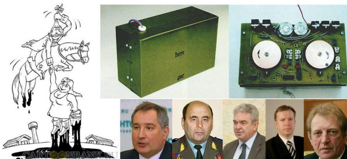
Fig.1. Idea of propulsion of satellite "Yubileiny" [2]; "Gravitsapa" [3]; leaders of the Russian cosmic program: D.Rogozin, V.Menshikov, V.Nesterov, A.Seliverstov, A.Varochko [7].

This research is motivated by huge amount of fake results. Many of them pretend to be scientific. Especially grave the frauds are in Russia, due to the total corruption [1]. An example [2,3,4] of a fraud is presented in Fig. 1.