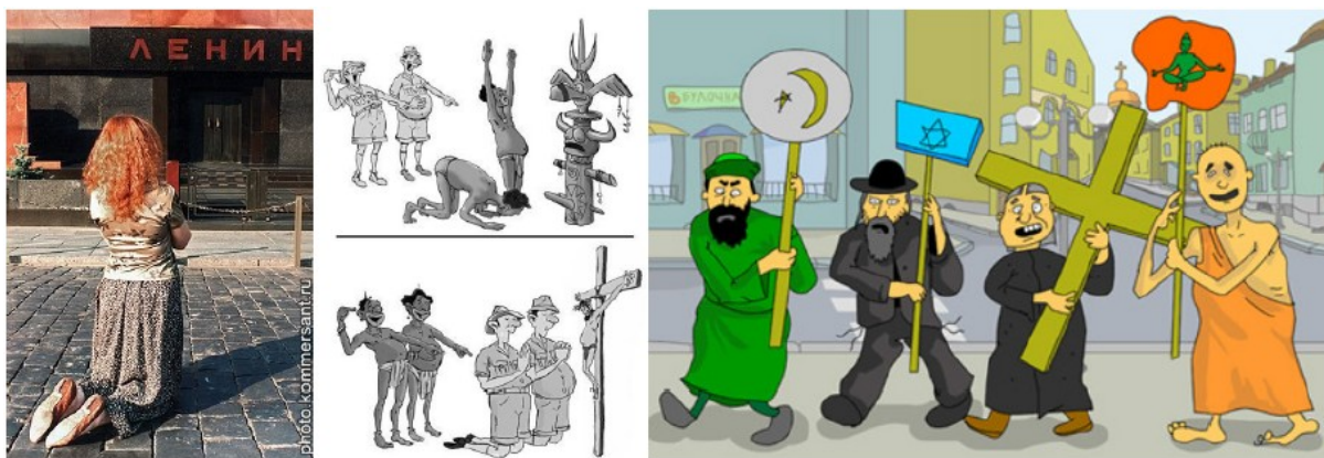
Fig. 4. Religions: Illustrations by S. Tihomirov [52], V. Shmakov [53], O. Kuvaev [54]

The adepts consider their own belief as the only true concept, deny the dogmatic character of their believes [44] and treat any deviant behavior as crime, heresy and mental illness; the wrong-believers are punished or undergo the forced medical treatment [26].