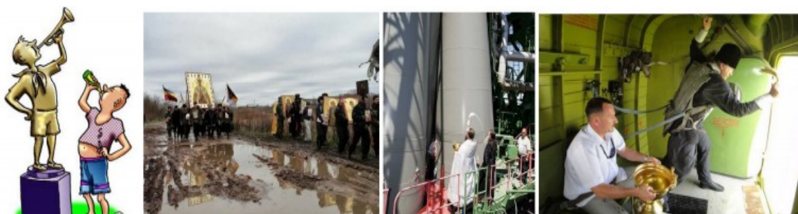
Fig. 2. Customs [30]: drinking from the neck of bottle; use of magic for roads, missiles, dams.

The semantics of the human languages and their understanding, the meaning of words is important part of a language. Customs, as kind of knowledge, give sense to other kinds of knowledge, considered below.