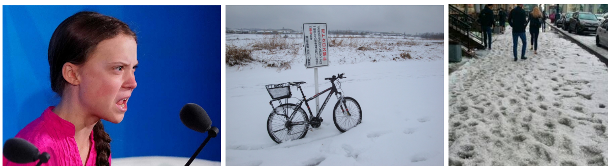
Fig. 7. Greta Thunberg, 2019 [76]; Japan, Tamagawa 2013.01.14 [77]; Peterburg 2017.07.22 [78]

Another example refers to the Global warming. Since year 2019, this concept is associated with name of Greta Thunberg [76] shown in first picture of Fig. 7.