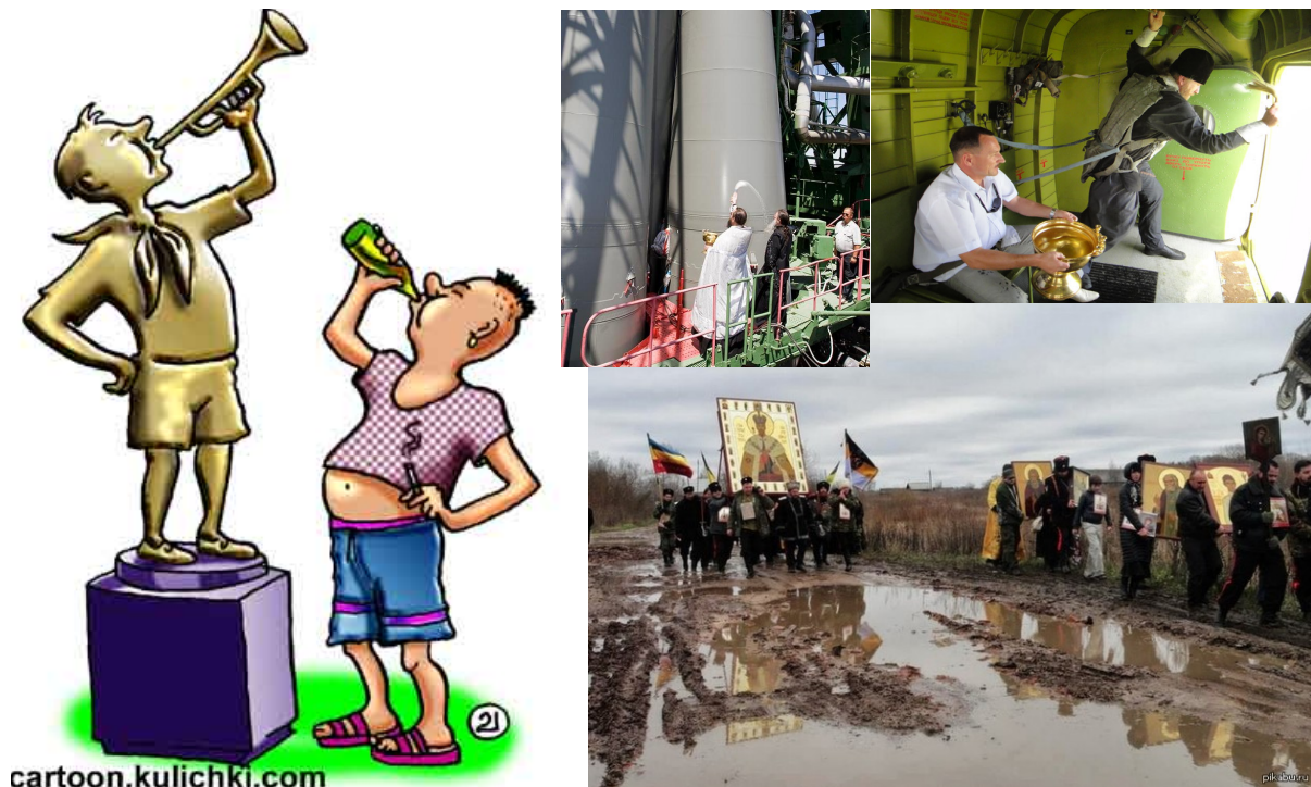
Fig. 2. Customs [30]: drinking from the neck of bottle; use of magic for roads, missiles, dams.

The semantics of the human languages and their understanding, the meaning of words is important part of a language. Customs, as kind of knowledge, give sense to other kinds of knowledge, considered below.