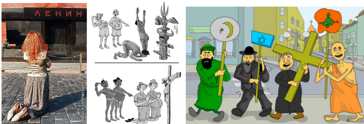
Fig. 4. Religions: Illustrations by S. Tihomirov [52], V. Shmakov [53], O. Kuvaev [54]

The adepts consider their own belief as the only true concept, deny the dogmatic character of their believes [44] and treat any deviant behavior as crime, heresy and mental illness; the wrong-believers are punished or undergo the forced medical treatment [26].