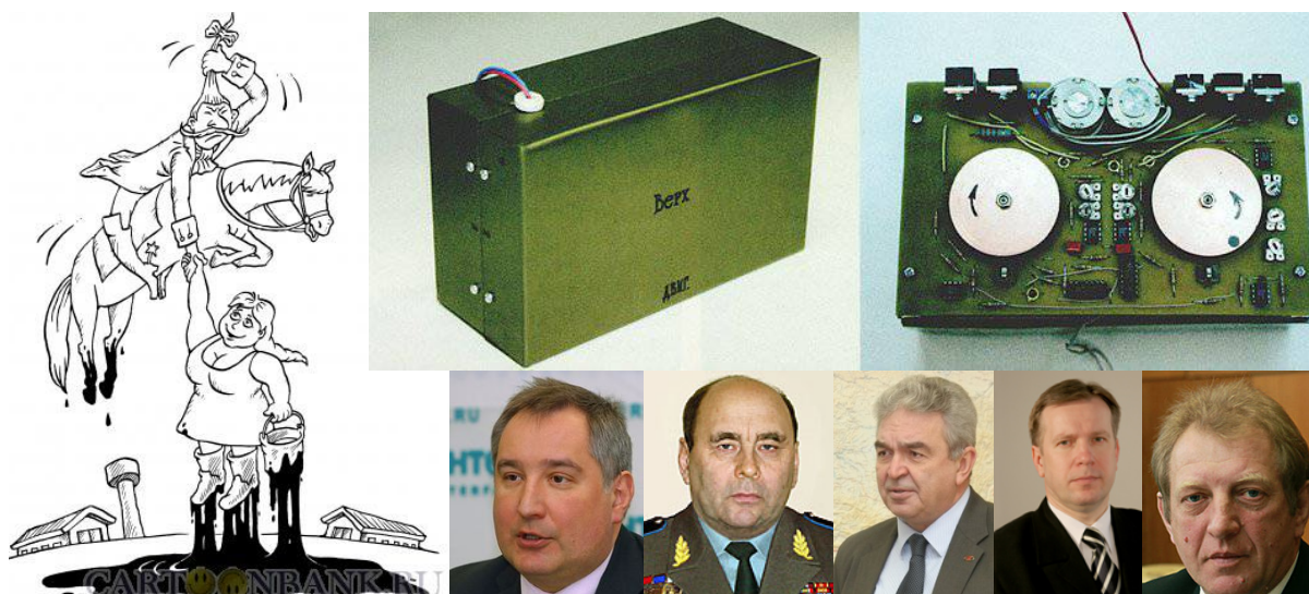
Fig.1. Idea of propulsion of satellite "Yubileiny" [2]; "Gravitsapa" [3]; leaders of the Russian cosmic program: D.Rogozin, V.Menshikov, V.Nesterov, A.Seliverstov, A.Varochko [7].

This research is motivated by huge amount of fake results. Many of them pretend to be scientific. Especially grave the frauds are in Russia, due to the total corruption [1]. An example [2,3,4] of a fraud is presented in Fig. 1.