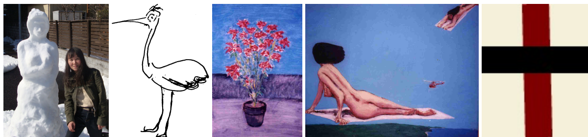
Fig. 3. Arts: Five examples of works by various artists [35]

There are many sciences about art. Aiming the specific application of the classification, the topics of customs and arts are presented here only declaratively.