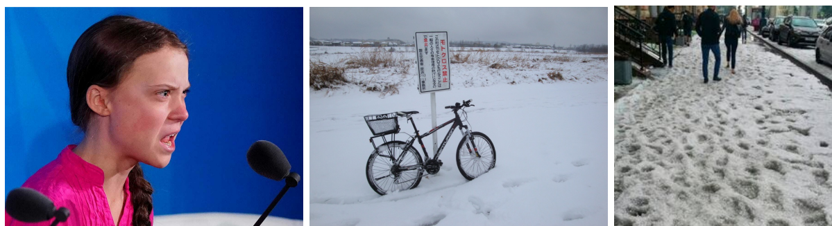
Fig. 7. Greta Thunberg, 2019 [76]; Japan, Tamagawa 2013.01.14 [77]; Peterburg 2017.07.22 [78]

Another example refers to the Global warming. Since year 2019, this concept is associated with name of Greta Thunberg [76] shown in first picture of Fig. 7.