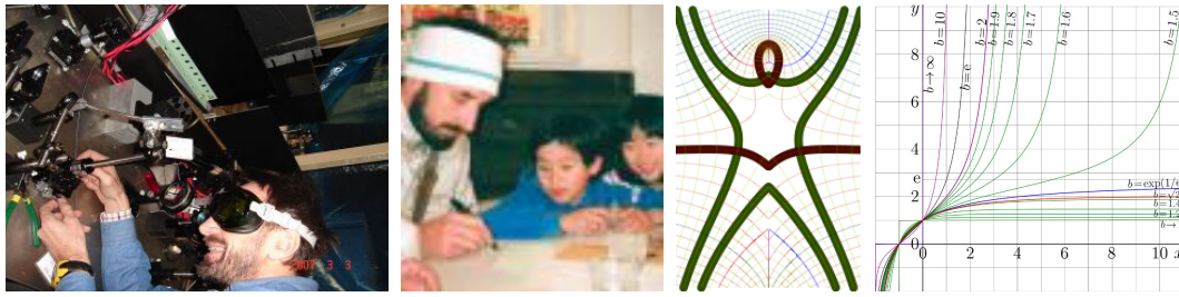
Fig.4. How to draw Science? [53, 54, 55, 56]

Note that in the definition of science, all the six properties are compulsory. For example, if the range of validity of a concept is the full set (id est, the concept is valid every time and everywhere), then, by definition, it is not scientific, as it does not satisfy the criterion S1, and there is no need to check properties S2-S6 to qualify such a concept as non-scientific.