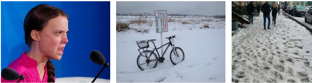
Fig.6. G.Thunberg 2019 [91] ; Honshu 2013.01.14 [92] ; Peterburg 2017.07.22 [93]

of snow during summer at Europe (say, at the latitude of Peterburg) and absence of snow at the Japan latitude (say, at the level of Tokyo) was supposed to confirm the concept, and the presence of precipitation of water in solid state should negate the concept. However, this happened to be not a case. The claims of the global warming remain even after the heavy snow at Tokyo area 2013.01.14 [92] and at Peterburg 2017.07.22 [93]. Since that, it is not possible to consider the global warming as a scientific concept. Even the adepts of that concept do not know, which observation can be considered as sufficient to refute it. In order to help the adepts of the global warming, such an experiment, observation is described below.