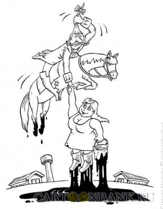
Fig.1. Idea of inertioid [2]

The abilities or pseudo-scientists to publish fricks geately exceed the apility of enthusiasts to analyze and to criticise them. Then, the frauds are used for so-called “money laundering”, leaving few funds for the scientific research. We need formal criteria to identify peseudo-scientific results.