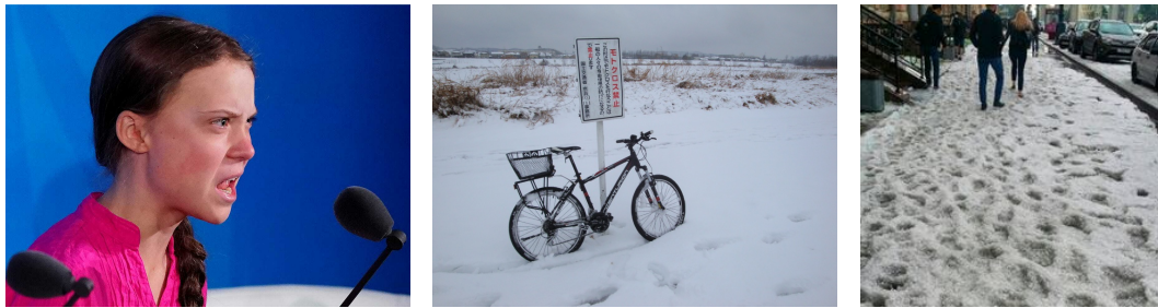
Fig.7. G.Thunberg 2019 [91] ; Honshu 2013.01.14 [92] ; Peterburg 2017.07.22 [93]

during summer at Europe (say, at the latitude of Peterburg) and absence of snow anytime of year at the Japan latitude (say, at the level of Tokyo) was supposed to confirm the concept. The presence of precipitation of water in solid state (in the conditions mentioned) should negate the concept. However, this happened to be not a case: after the heavy snow at Tokyo area 2013.01.14 [92] and at Peterburg 2017.07.22 [93], the adepts of the global warming still keep their claims.