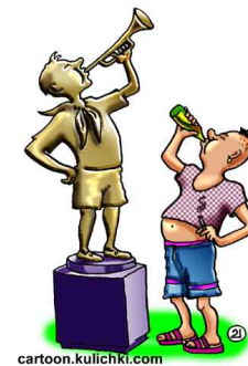
Fig.2. Custom [11]

The usual meaning of the Bible is custom, widely accepted in the Christian community. The sentence You shall love your neighbor as yourself allows various interpretations [33, 34], dependently on the meaning of the word love and its Hebrew and Aramaic equivalents. Some interpretations are not popular; so, they are not a custom. The interpretations of