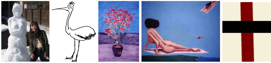
Fig.3. Arts: five examples of works by various artists [37, 38, 39, 40, 41]

the New Testament by Tim Rice [35] and that Michael Bulgakov [36], due to the wide spreading, can be qualified not only as an art, but also as a custom, at least in certain literature or musical communities. Such an interpretation should be qualified a knowledge. In such a way, the meaning of words appear as a knowledge.