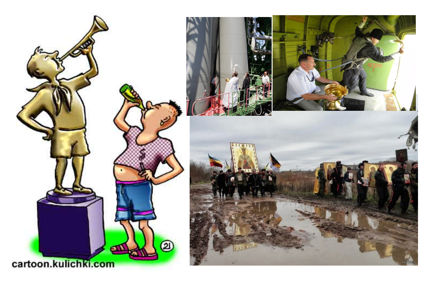
Fig. 2. Customs [30]: drinking from the neck of bottle; use of magic for missiles, dams, roads.

The genre of the last 3 pictures in figure 2 can be interpreted also as a religion (considered below) – under conditions, that the popes, performing the magic, believe, that their actions help to repair the faulty rocket, or stop the flood, or, at least, reduce amount of puddles and clay on the road.