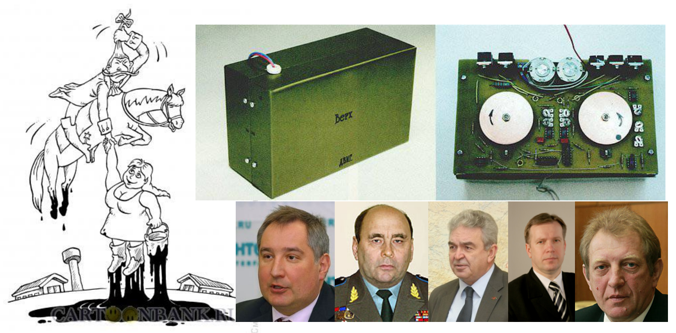
Fig.1. Idea of propulsion of satellite "Yubileiny" [2]; "Gravitsapa" [3]; leaders of the Russian cosmic program: D.Rogozin, V.Menshikov, V.Nesterov, A.Seliverstov, A.Varochko [7].

This research is motivated by huge amount of fake results published since beginning of century 21. Many of them pretend to be scientific. Especially grave the frauds are in Russia, due to the total corruption [1]. An example of such a fraud is exposed in Flg.1; it shows the main idea of self-propulsion [2] of the satellite "Yubileiny", the only available image [3] of inertioid "Gravitsapa", installed there, and leaders of the Russian cosmic program. They pretend that the "gravitsapa" provides the support-less force and changes the orbit of the satellite (breaking the fundamental laws of Physics) [4, 5, 6].