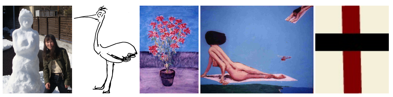
Fig. 3. Five works by various artists [35]