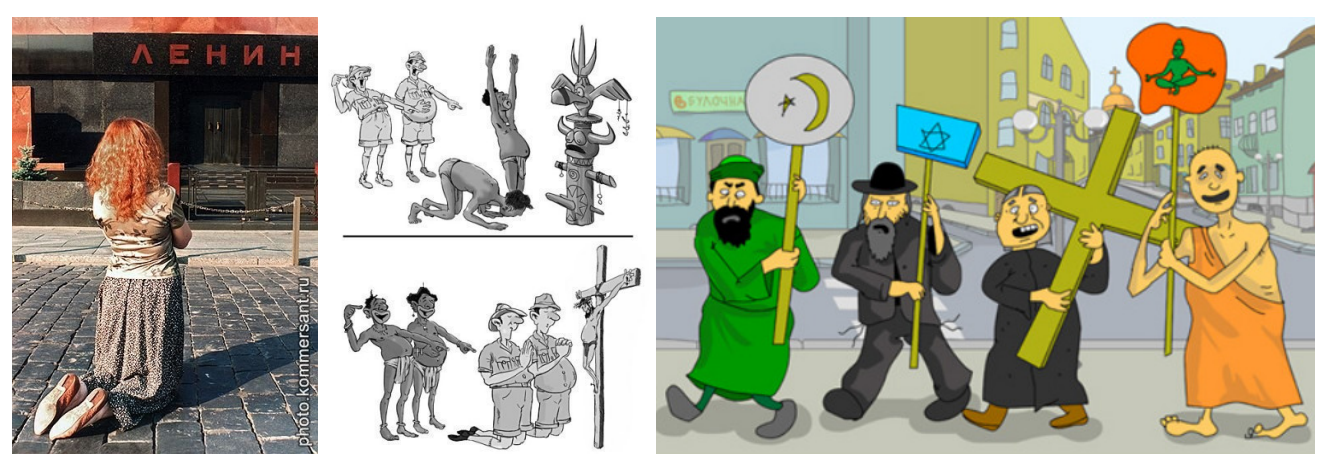
Fig.4. Religion may have various forms [36]